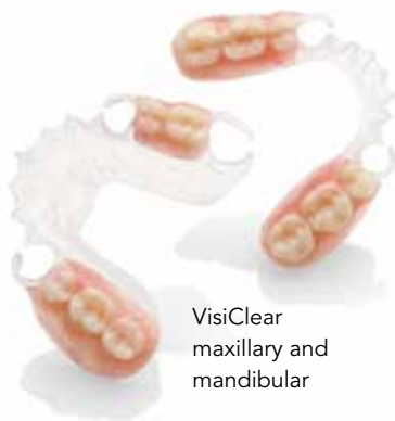
VisiClear maxillary and mandibular